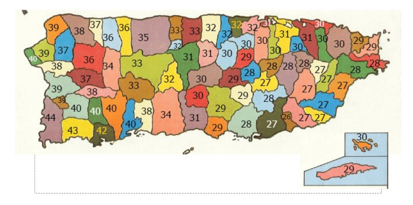
Figure 2 - Spectral Response Acceleration at period of 1.0 seconds, 5% of critical damping, recurrence of 2,475 years (probability of exceedance of 2% in 50 years)